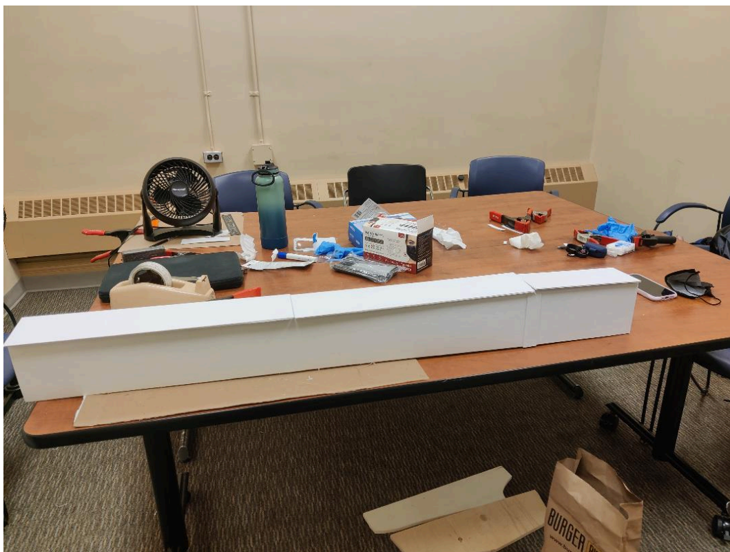
Figure 1. Wide body shot of Team 701's bridge.

The following figure is a wide-body shot of our bridge.